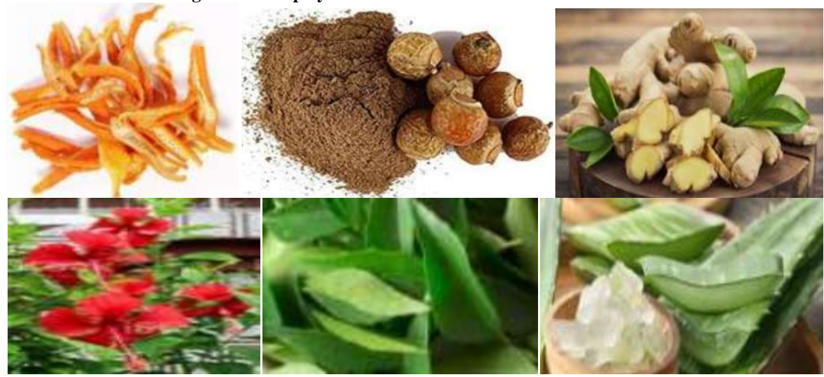
Figure 1.5. Common herbal oil ingredients (From Left to Right: Orange peel, Reetha, Ginger, Hibiscus, Curry leaves, and Alove.

• They are made out of national essential antiseptic properties that prevent our hair and scalp from the harsh UV-rays of the sun thus preventing skin infections [6]